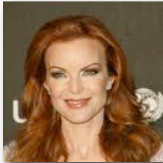
#110 - Marcia Cross