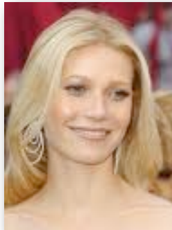
#130 Gwyneth Paltrow