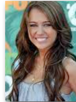
#120 Miley Cyrus