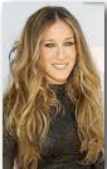
#150 Sarah Jessica Parker