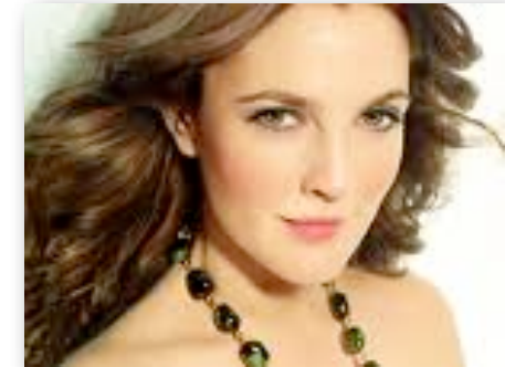
#140 Drew Barrymore