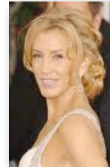
#140 Felicity Huffman