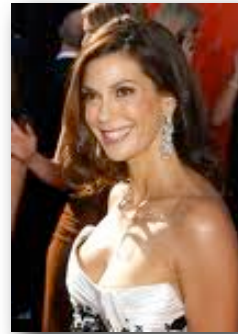
#120 Terri Hatcher