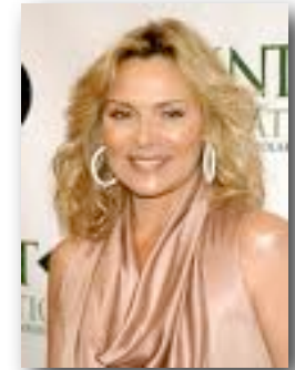
#120 Kim Cattrall