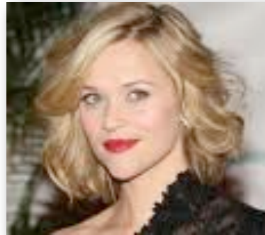
#130 Reese Witherspoon