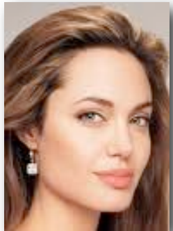
#125 Angelina Jolie