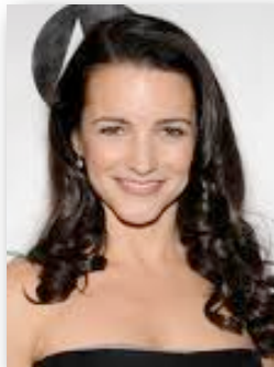
#160 Kristin Davis