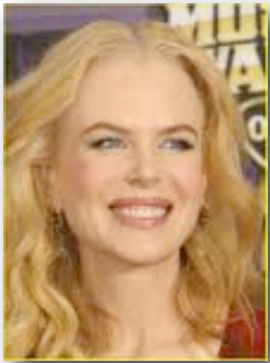
#110 - Nicole Kidman